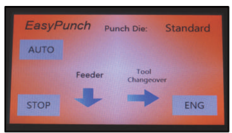
LCD touch screen interface