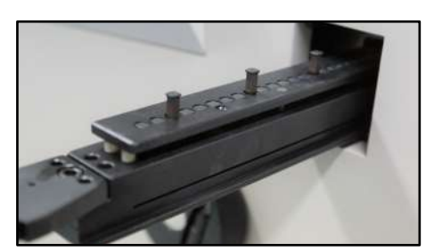
Wide range of quality punch dies with removable pins