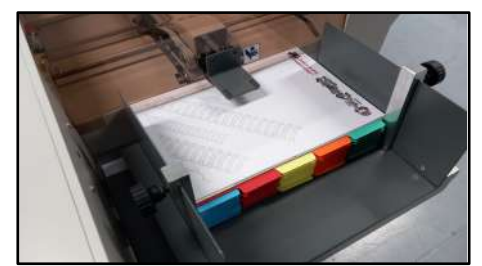
Adjustment of the feeder with magnetic and sliding stops