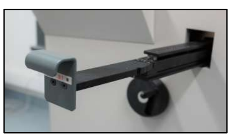
Easy die change in less than 2 minutes