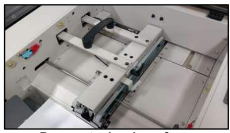
Proven technology from DocuPunch® PLUS